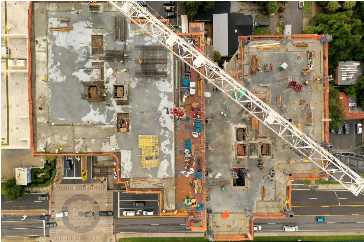
BIRDS EYE VIEW (LEVEL 17 NORTH POURED. 17 SOUTH BEING DECKED)